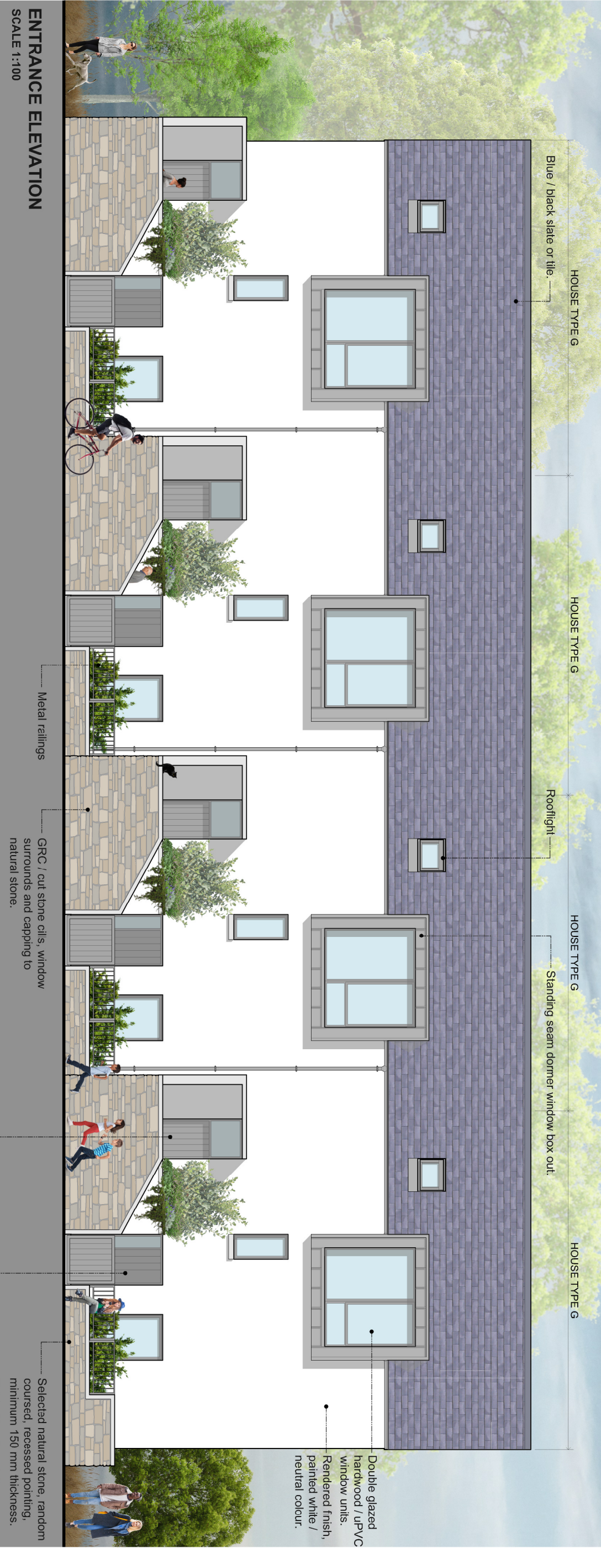
ENTRANCE ELEVATION SCALE 1:100