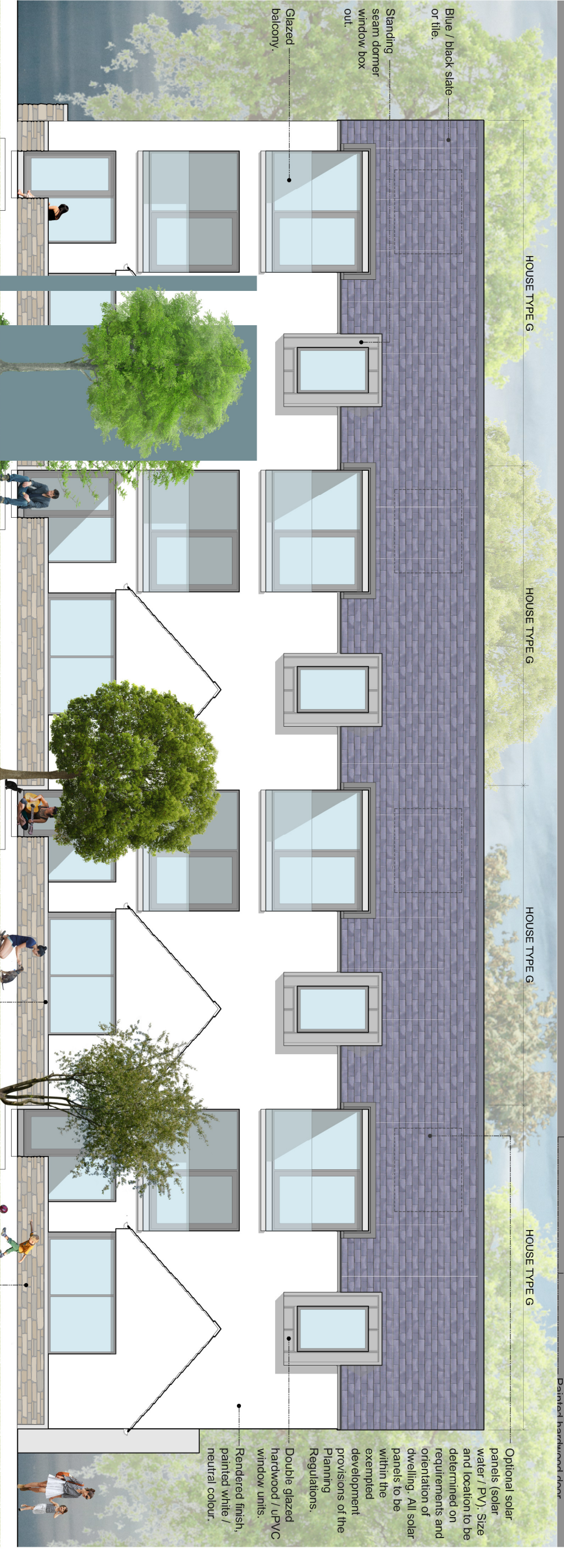
COURTYARD ELEVATION SCALE 1:100

REFER TO SITE LAYOUT PLAN FOR INDIVIDUAL HOUSE FLOOR LEVELS AND HOUSE ORIENTATION